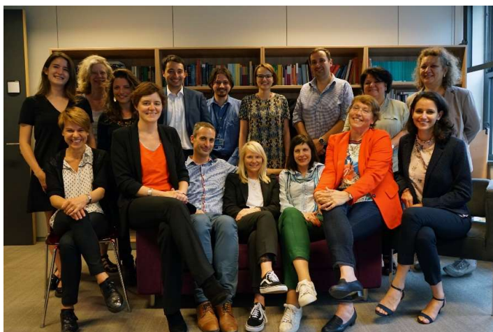
The EDPB Secretariat